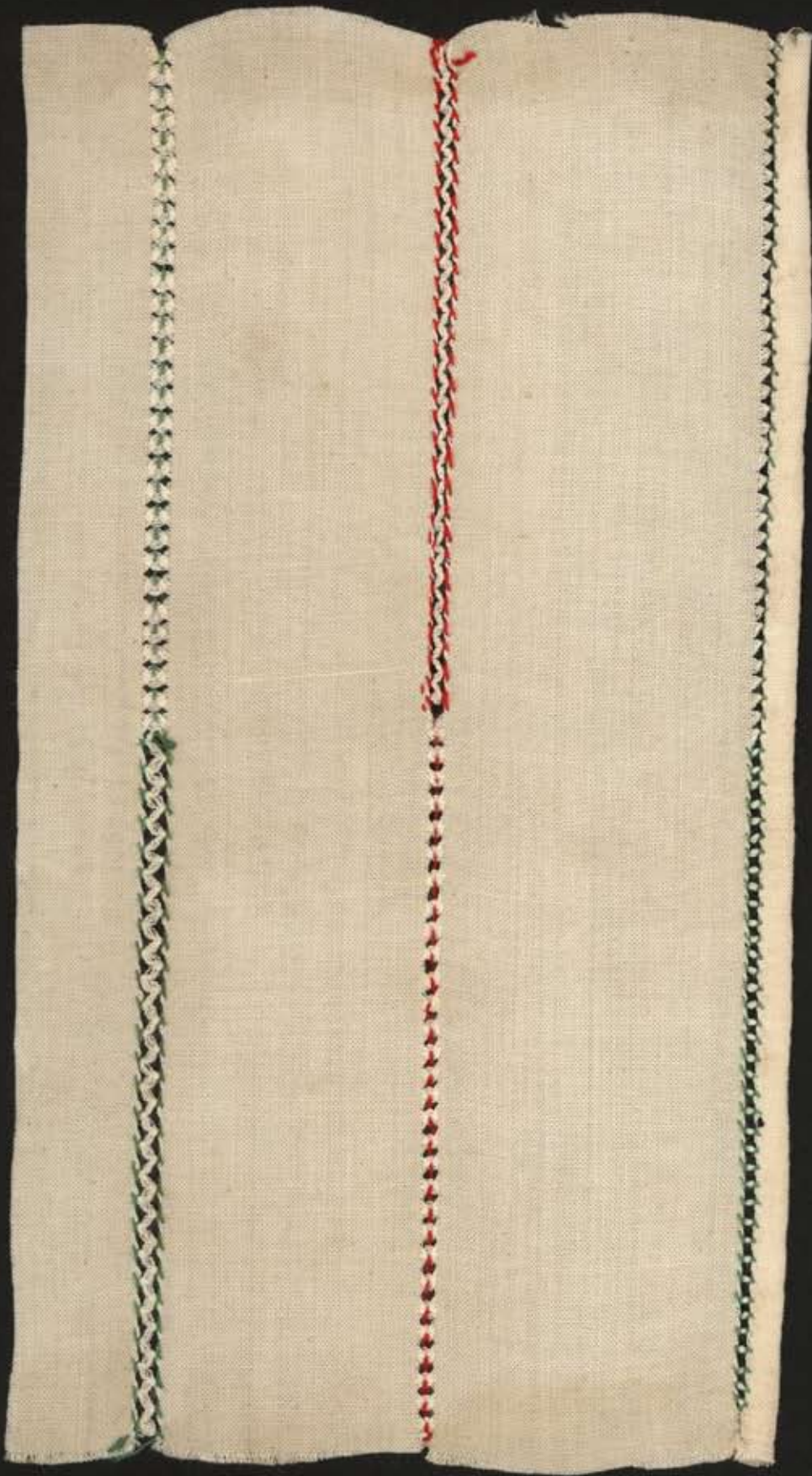
走針 Running stitch.