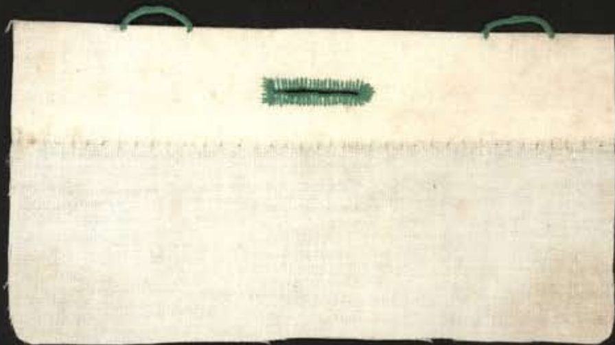
( Button stitch. )