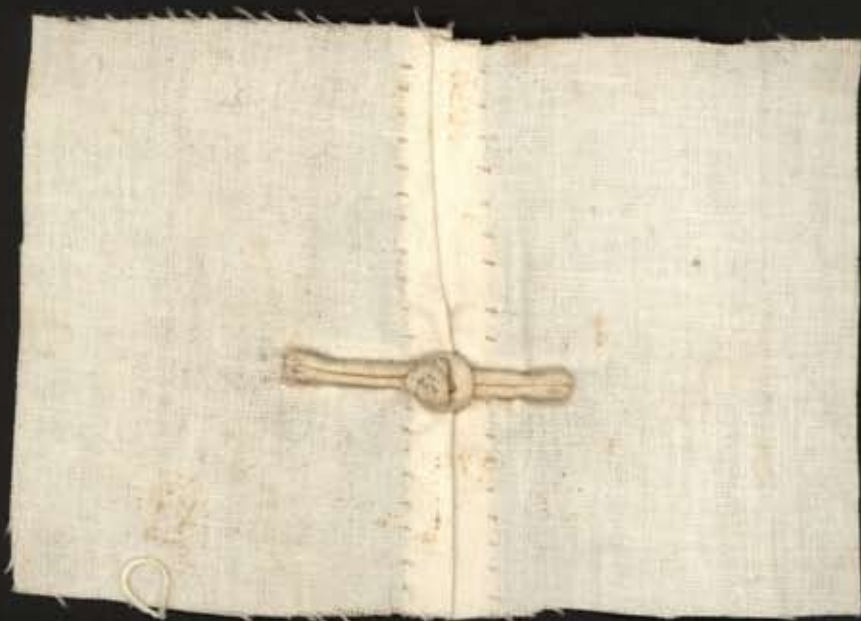
Chinese Button & Button hole