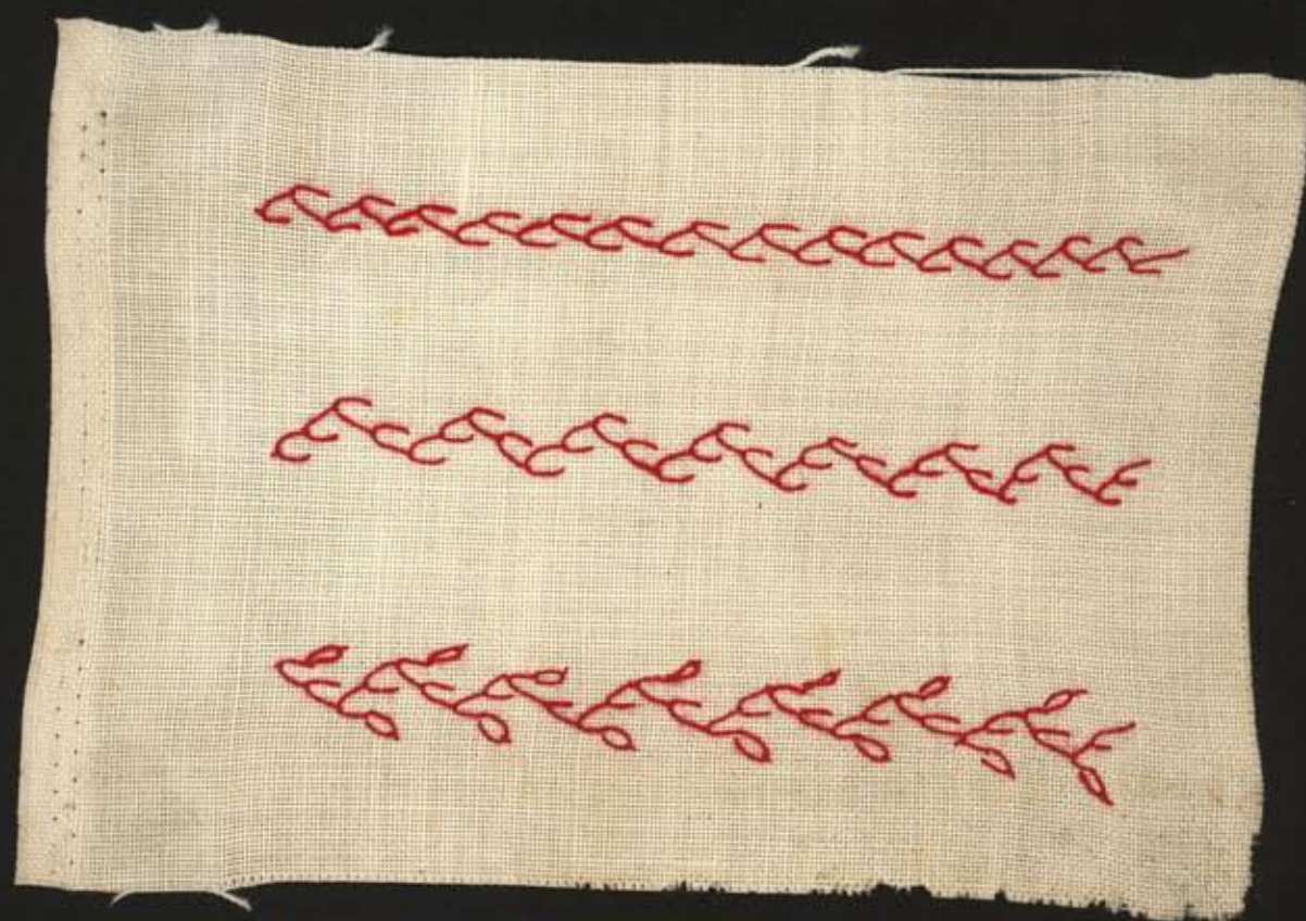
羽毛針步 (Feather stitch).